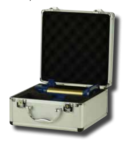
ST-320BL in Included Metal Carrying Case