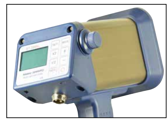
Operation Panel & Flash Adjustment Dial