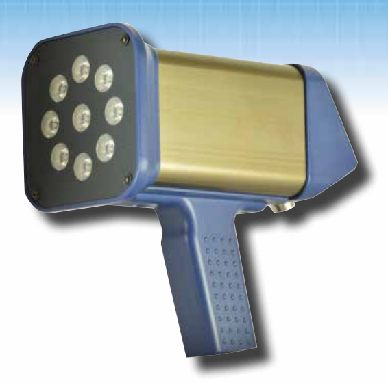
ST-320BL Black Light LED Stroboscope

The ST-320BL is designed for speed and frequency measurements in the printing, packaging, textile, automotive, cable, mining, steel, chemical, optical and medical industries in various applications.